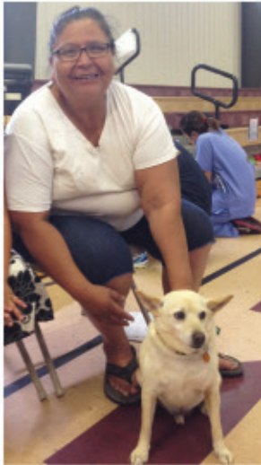
Skippy returns for his RAVS check-up.

Every RAVS clinic has its own magic and its own stories. Sometimes it's a dramatic life-saving procedure or a deeply touching moment of connection between a volunteer and a community member. Sometimes it's the simple reward of knowing we've helped keep a pet healthy and at home. And sometimes it's the beauty of seeing a patient like Skippy Johnson trot into our clinic this year on the Standing Rock Sioux Reservation in South Dakota.