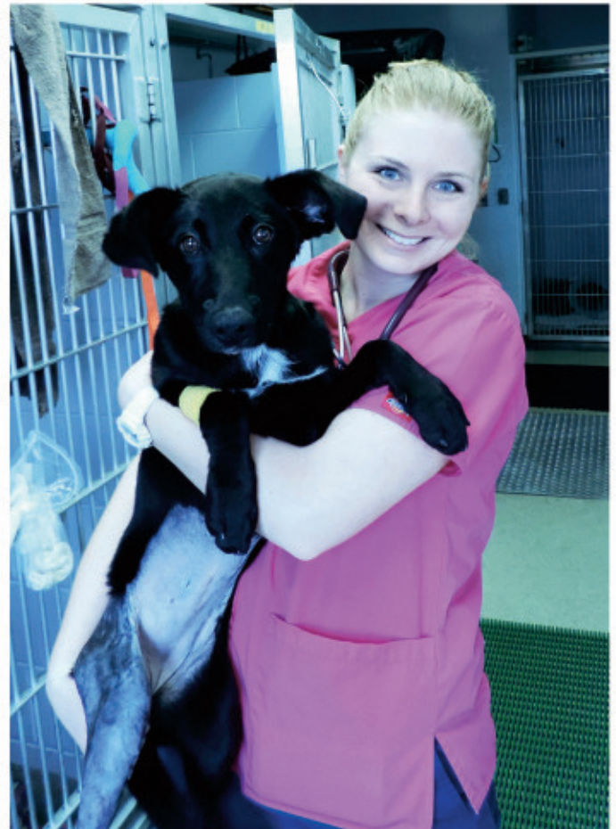
Bess arrived at a Philadelphia animal shelter with an orthopedic injury. Her tibial tuberosity avulsion was repaired with pins and wire as part of the University of Pennsylvania's new Saving Lives by Saving Limbs program which is sponsored by HSVMA. Bess was adopted by a fourth-year veterinary student.