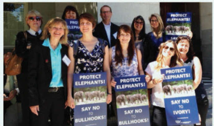
A group of HSVMA representatives joined representatives from The Humane Society of the United States in lobbying for reforms to protect elephants at the California Humane Lobby Day.

"Participating in Lobby Day on Capitol Hill is a very gratifying experience. As veterinary professionals, we have a lot of credibility and legislators and their staff respect our expertise, listen carefully and ask thoughtful questions. I enjoy advocating for animals who are the most disenfranchised and voiceless members of our society, and I believe it makes a difference for them over time and on a larger scale."